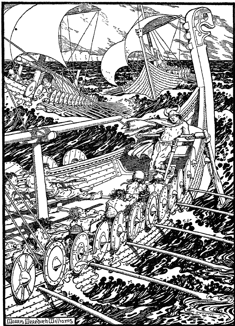
THE COMING OF THE NORSEMEN